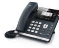
Yealink T4 series