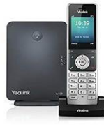
Yealink DECT Cordless